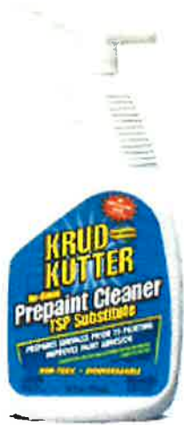
PC326 - 32 oz Spray